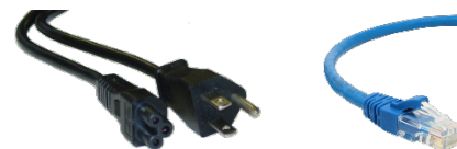
Mini Power Cord Mini Ethernet Cable