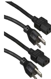
Rack Power Cords