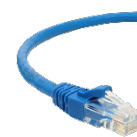
Rack Ethernet Cable